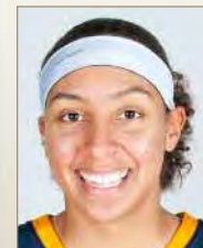
Layschia Clarendon Jr., G